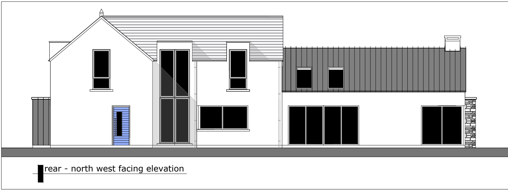
rear - north west facing elevation